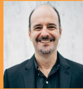
Isaac Mizrahi Alma Advertising